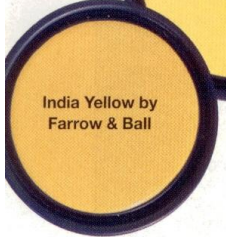
India Yellow by Farrow & Ball

The color yellow warms up a space—it's uplifting when used in light-filled rooms and with complementary hues. Richer yellow with a touch more gold, inspired by agricultural regions such as Tuscany and Provence, adds depth and a sense of European elegance to interiors.