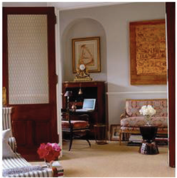
[all image of rom Wee Poparhricities Interiors]

TAGE: ALEX PAPACHRISTIDIS INTERIORS - DECOR - CALLERY WALL - INTERIOR DESIGN - INTERIOR DESIGNER - LIVING ROOM - STRIPES - WALL SCONCES - ZEBRA PRINT.