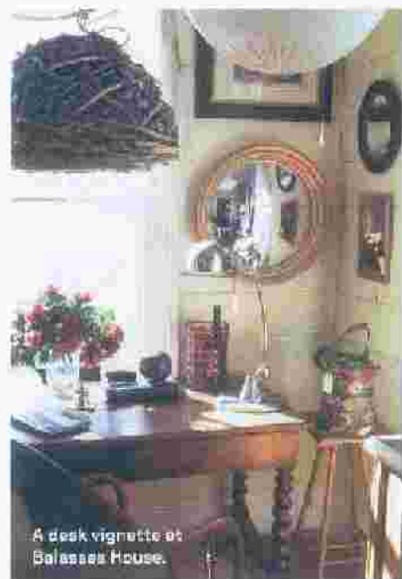
A desk vignette at Balasses House.