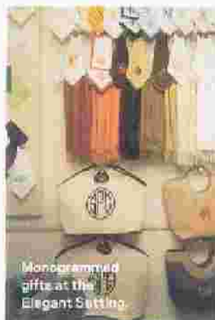
Monogrammed gifts at the Elegant Setting.

hard-to-find vintage china or crystal pattern. Best sellers: