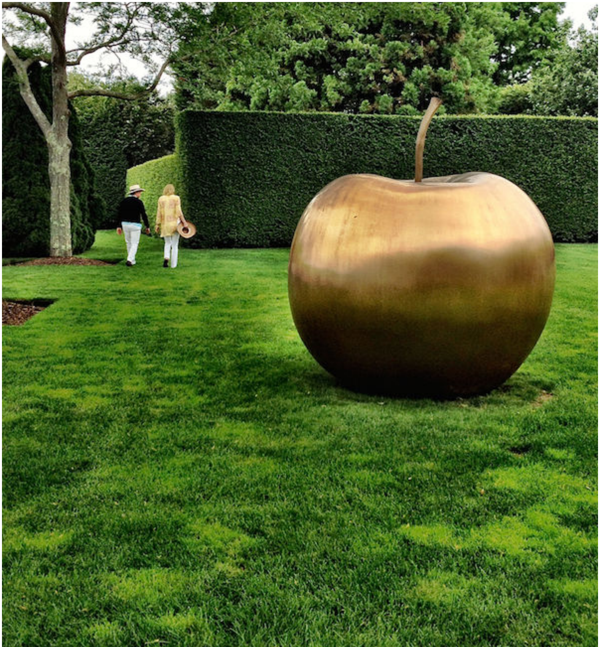
A walk through the garden is a cultural outing